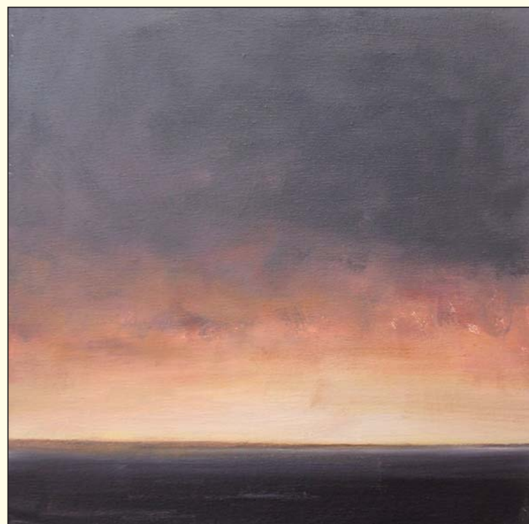
GAGE OPDENBROUW, Last Golden Light , 2006, oil on canvas, 12 x 12"

CELEBRATING THE CALIFORNIA COLLEGE OF THE ARTS (CCA) CENTENNIAL