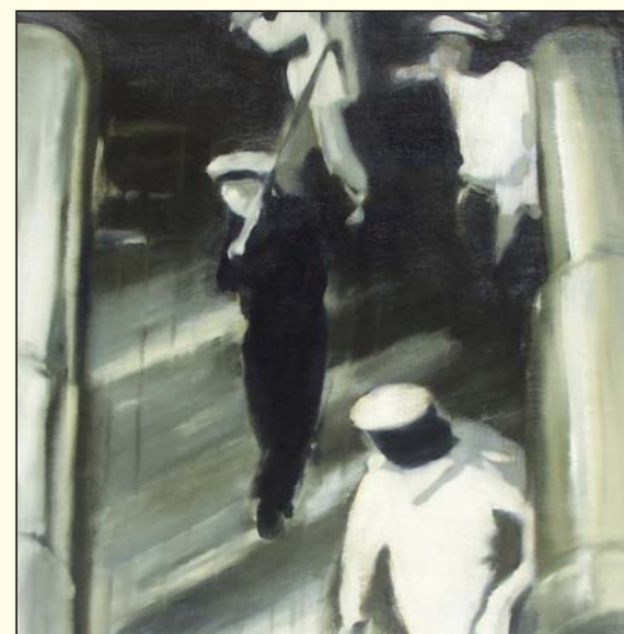
CHRIS BROWN, Under the Guns , 1993 oil on linen, 30 x 30"